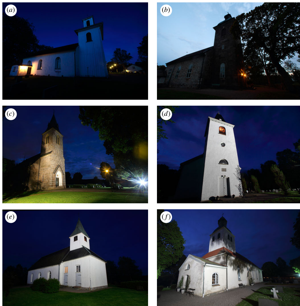
Figure 1. Examples of the three categories of flood-lighting used on the churches examined during this survey; (a,b) not lit, (c,d) partly lit, (e,f) fully lit. All churches shown harboured colonies of long-eared bats in the 1980s. In 2016 the colonies were gone from (d) and (e) but remained in (a–c) and (f).

the outside. In all cases the emerging bats were unambiguously recognized as Plecotus because their diagnostic long ears could be seen.